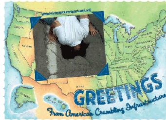
ASCE's web logo: Greeting from America's Crumbling Infrastructure

The American Society of Civil Engineers (ASCE) recently released its 2005 Report Card for America's Infrastructure. The report card assessed 15 infrastructure categories individually, and collectively gave the system a "D." The assessed categories included aviation, bridges, dams, drinking water, energy (national power grid), hazardous waste, navigable waterways, public parks and recreation, rail, roads, schools, security, solid waste, transit and wastewater. Both roads and transit have worsened since the last report card. Roads went from a D+ to a D and transit from a C- to D-.